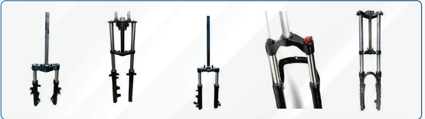
Two Wheeler Front Fork Assembly