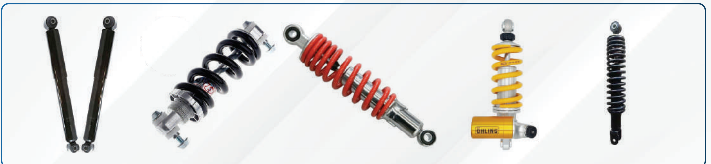
Rear Shock Absorber