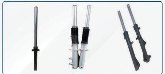
Front Fork Leg Assembly