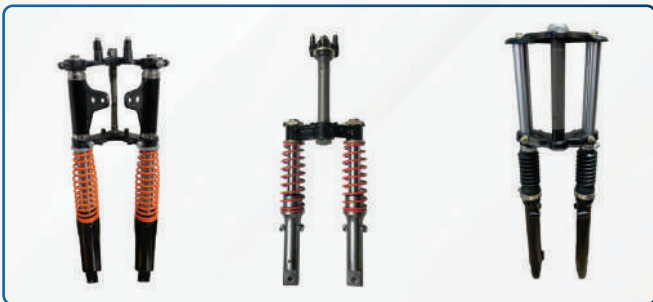
Three Wheeler Front Fork Assembly