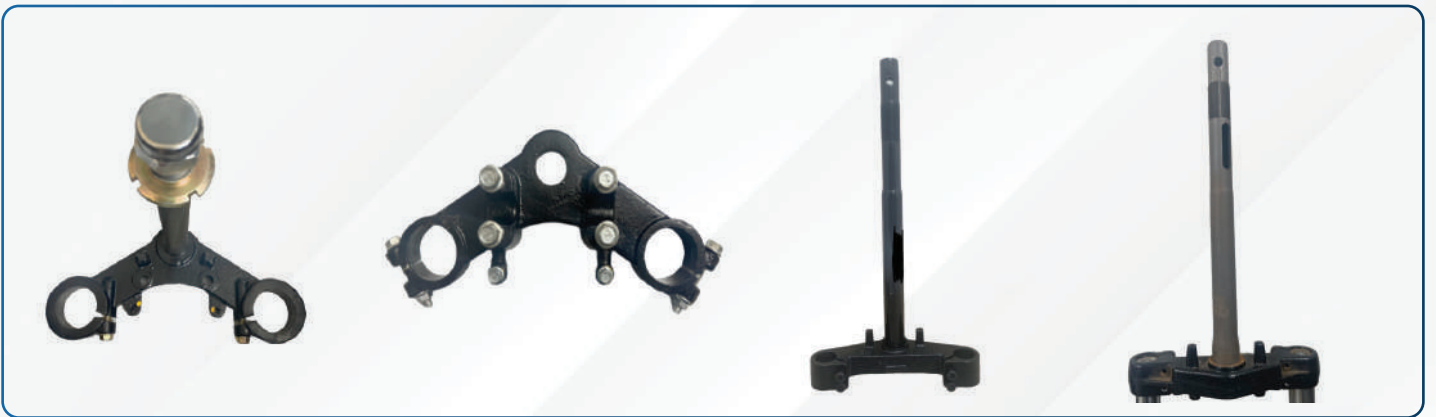
Handle tee Column